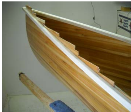
May 31, Week 6 ( 110 hours of work completed)