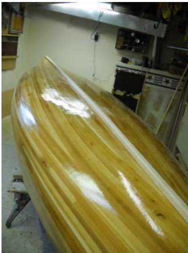
May 20, Week 5 (81 hours of work completed)

Outside of hull with fiberglass and epoxy, note the bare wood keel ready to be attached