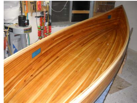
May 31, 2011 Week 7, first coat of varnish, missing the yoke/thwart at center beam

Cutting the jagged edge from the gunwale prior to sanding flat